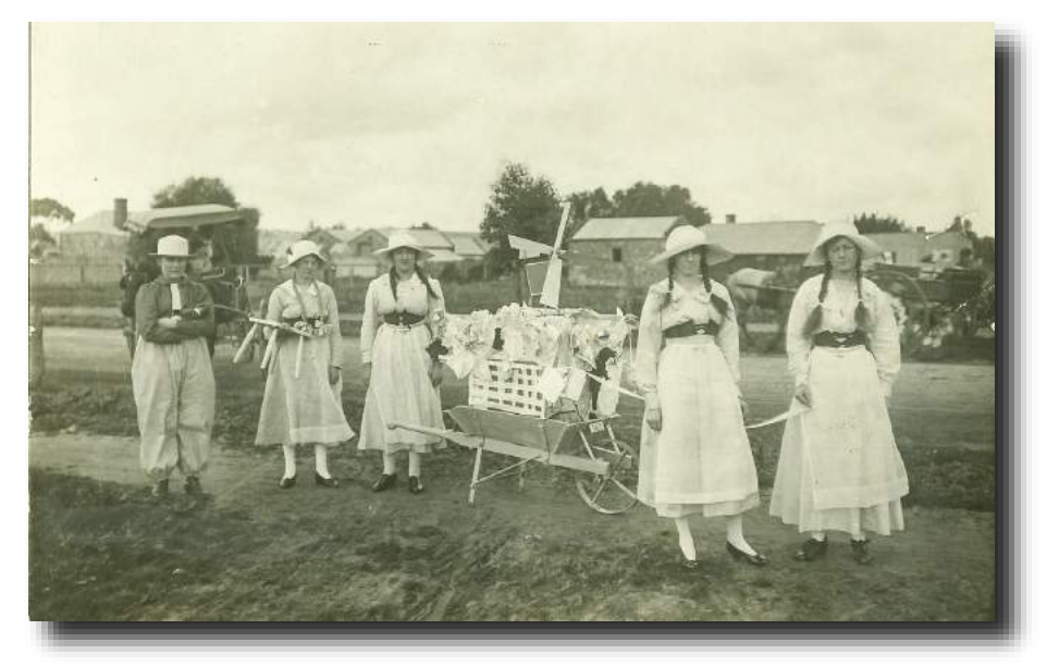
If you wish to see more historical photographs, please refer to our Flicker account www.flickr.com/photos/sdhsphotos and select the "Album" option