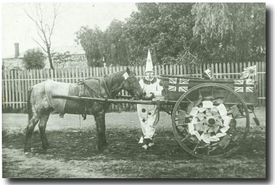
Salisbury Australia Day Celebrations July 1918 Wiltshire St