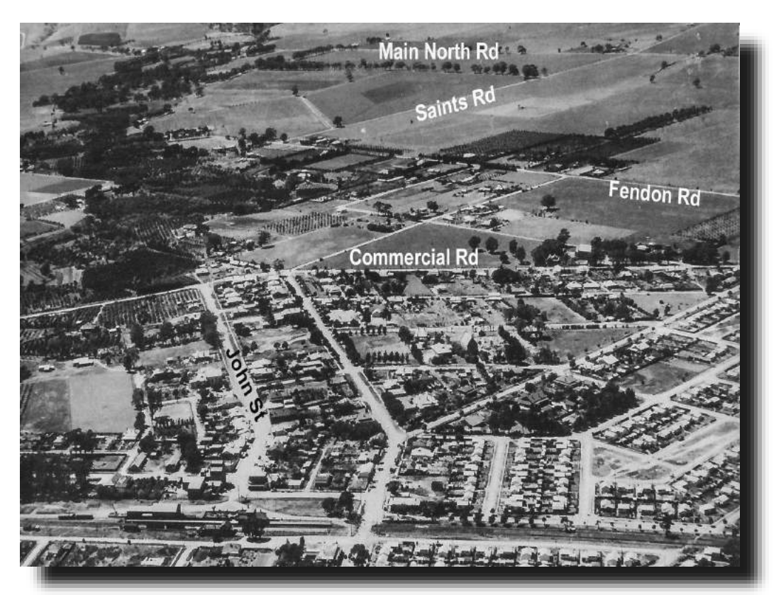
Aerial View Saints Rd in the distance late 1940's