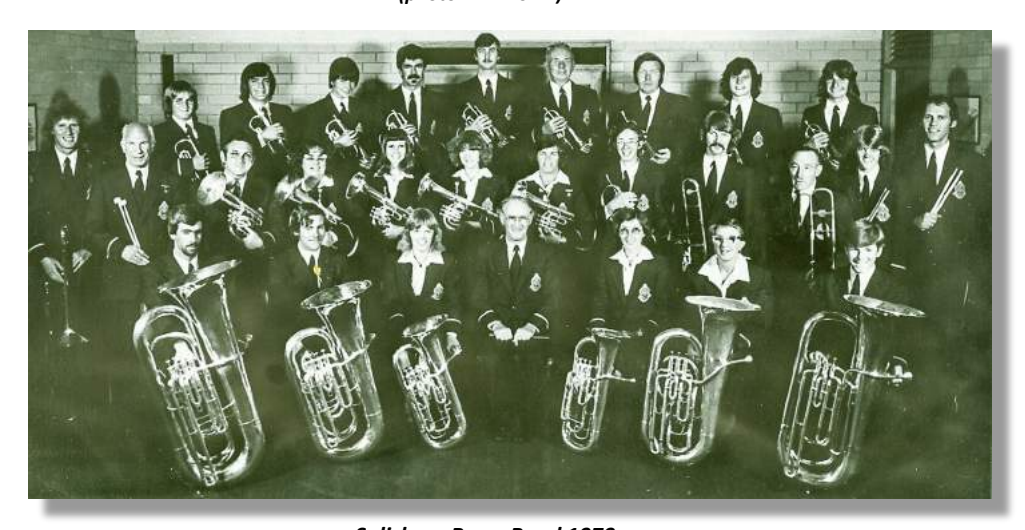
Salisbury Brass Band 1979

If you wish to see more historical photographs refer to our Flicker account www.flickr.com/photos/sdhsphotos and select the "Album" option