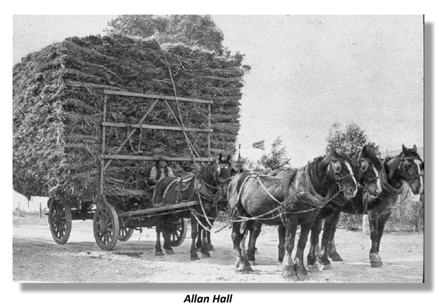
Hay Carting around 1910