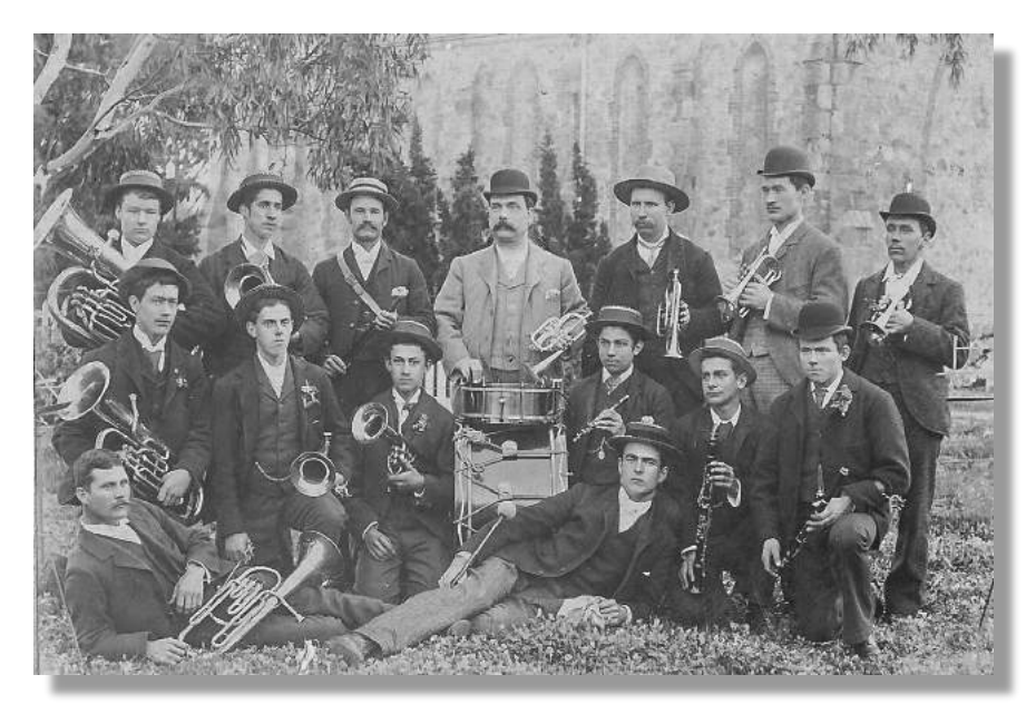
Salisbury Town Band 1886 St Johns Church in the background