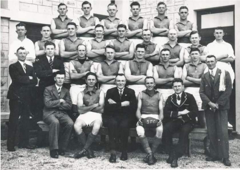
Salisbury Star's Football Team 1937