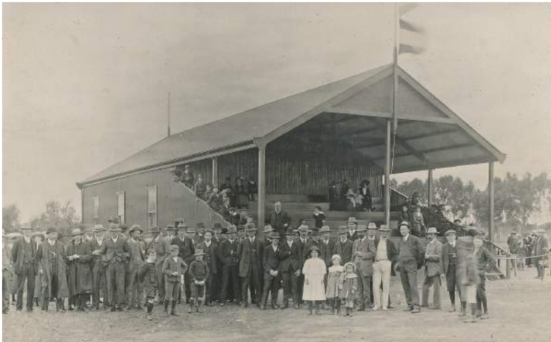
Salisbury Oval Recreational Centre & Grand Stand opened 1913

If you wish to see more historical photographs, please refer to our Flicker account www.flickr.com/photos/sdhsphotos and select the "Album" option