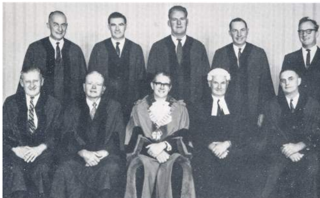
City of Salisbury Councillors 1964 Page:4

Elizabeth was less than 12 months old in 1956 when rumblings of discontent with Salisbury District Council's administration began. Following a long period of councillor-clashing, feuding and much social strife, the Salisbury and Elizabeth District council did not oppose a petition lodged in 1963 for the severance of the Elizabeth area and its constitution as a separate municipality.