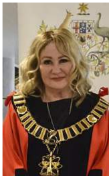
Current City of Salisbury Mayor Gillian Aldridge OAM; elected in 2008

The City motto - Consilio et Prudentia (with Wisdom and Prudence) forms the base of the emblem.