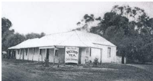
“The Bird in the Hand Hotel” locate on the corner of the Main North and Montague Roads Dry Creek 1847

In the 1850’s, due to the slow means of transport there were numerous hotels & Inns built, many very basic constructions. These included, Old Spot, Lass O’Gowrie, Farmers, Salisbury, Bull & Mouth, Coach & Horse, Scottish Chief, Busy Bee, Bird in Hand, Waterloo Cnr, Railway, Governor MacDonnell, Happy Home. Refer the map on Pg 4 for location etc.