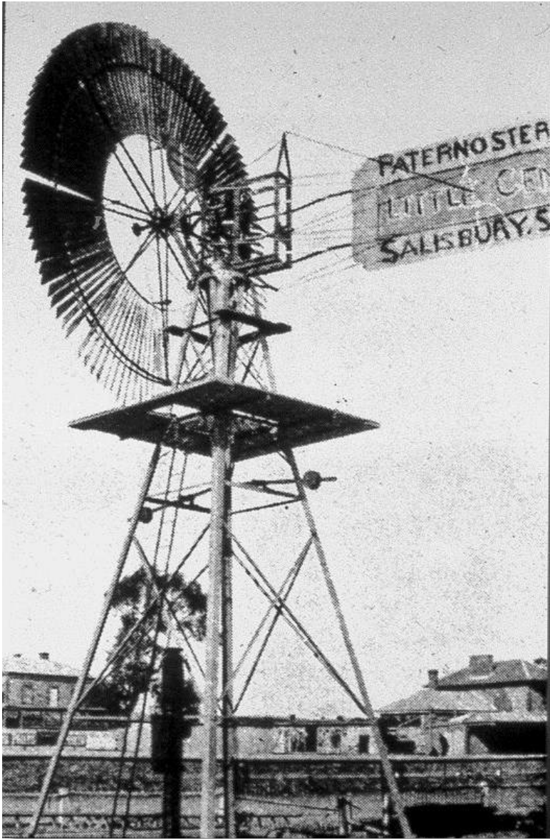
Paternoster's "Little Gem" windmill Located west of Salisbury Railway Station

If you wish to see more historical photographs, please refer to our Flicker account www.flickr.com/photos/sdhsphotos and select the "Album" option