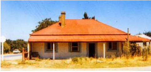
“The Waterloo Inn” at the corner of St Kilda and Pt. Wakefield roads was built in 1853 and became a hotel in 1857. Demolished in 1973.