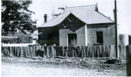
H Walpole built “The Bolivar Hotel” in 1854 on the intersection of Bolivar & Kings Rd. Originally it was 2 stories, with stables at the rear. In early 1900’s it was converted to accommodation and demolished in 1990’s

Around 1895 a new “Bolivar Hotel” was built on the corner of Pt Wakefield and Bolivar roads . Fire destroyed this hotel in 1920.