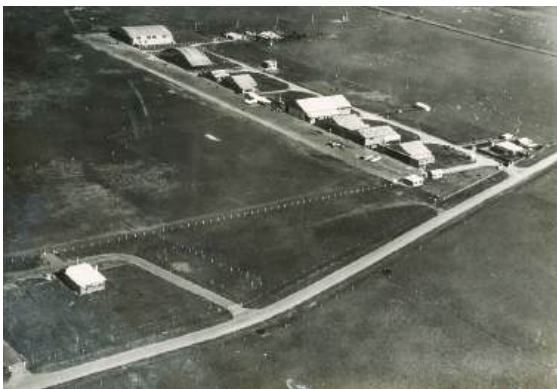
Parafield Airport Buildings Mid 1930's Fire Station building as seen above is in the bottom left corner

Parafield Airport is now mainly a training centre and records around 200,000 movements per year.