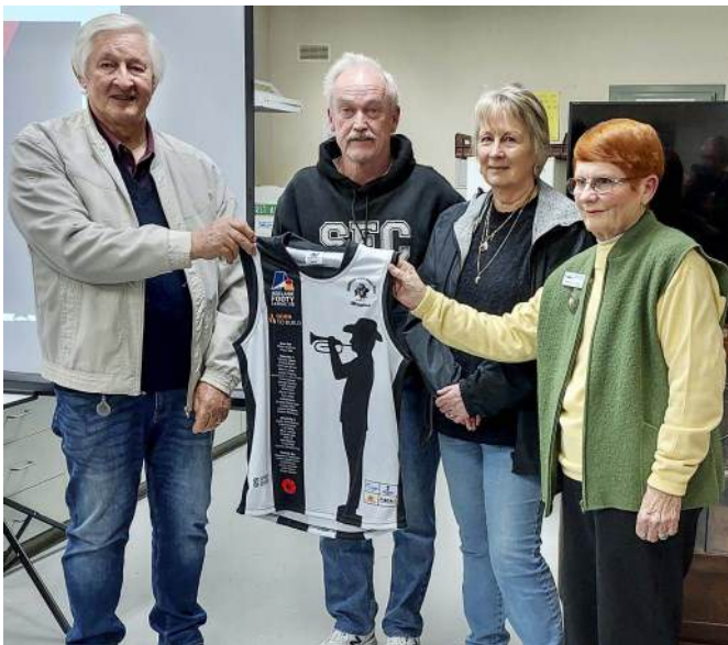
Salisbury Football Club representatives presenting SDHS with their Anzac Day Guernsey